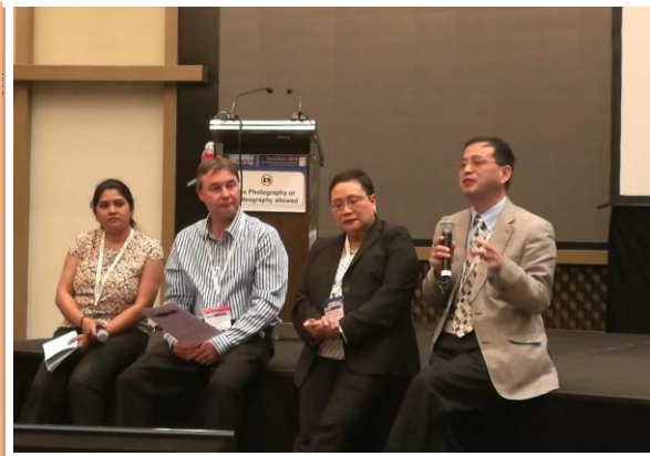
FOP WORKSHOP Q&A SESSION